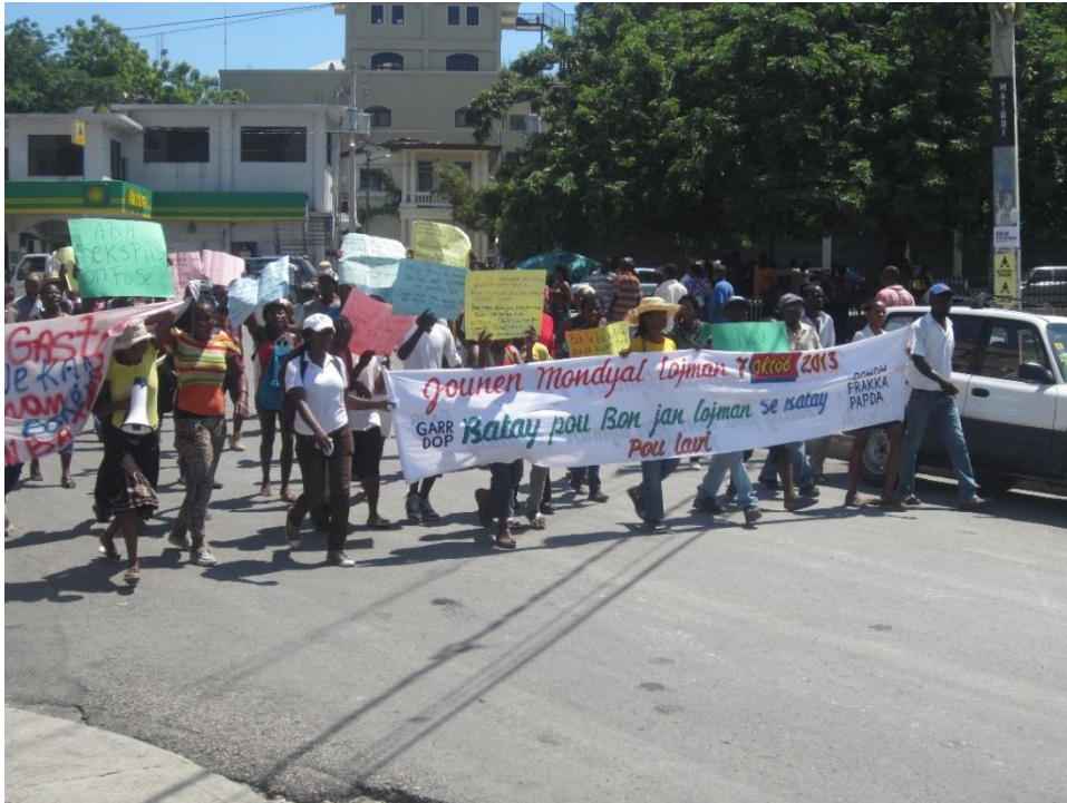
Below: Demonstration to mark World Habitat Day, Port-au-Prince, October 2013.